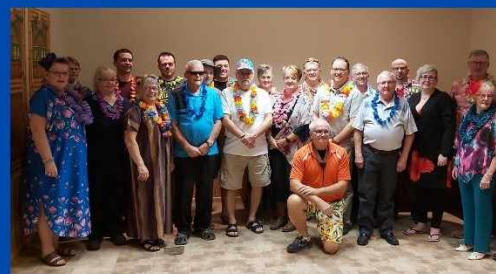
CRYSTAL CITY LIONS CLUB