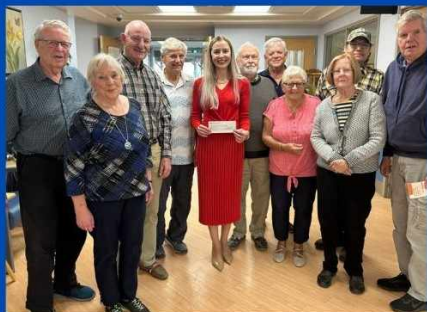
LIONS CLUB OF WINNIPEG